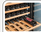
Sliding wooden shelves