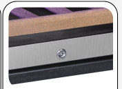
Lock fitted as standard