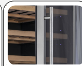
External cylindric handle in stainless steel